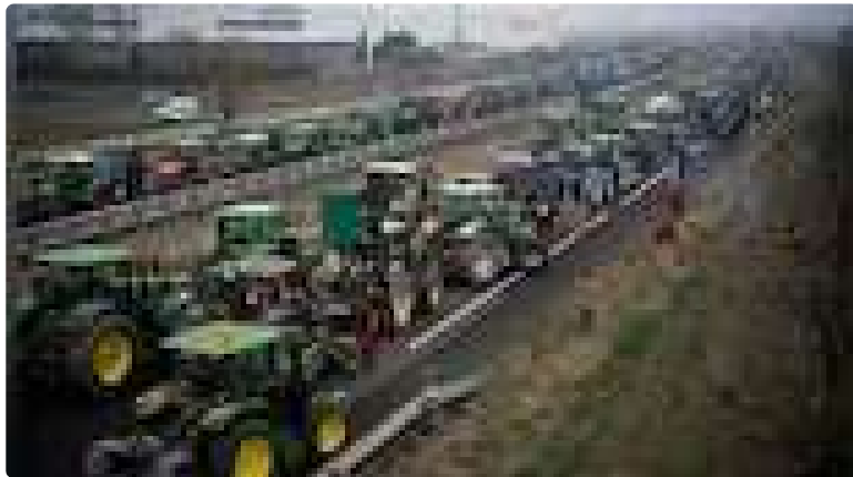
Vantage | What links Europe's farmer protests to those India saw?