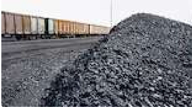
Black diamond: Why there is an urgent need to increase India's investment in R&D in coal technologies