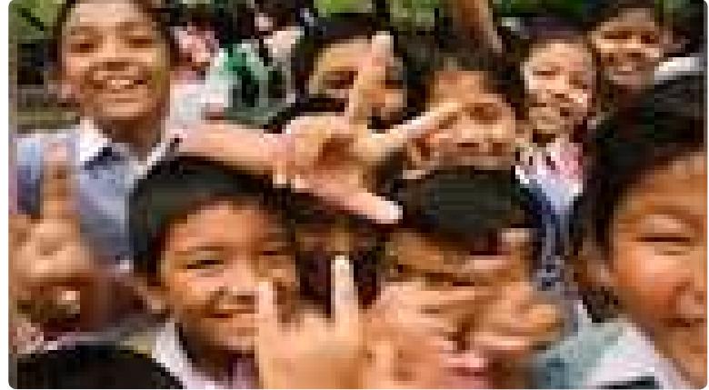
Family Planning: How many children are too many?