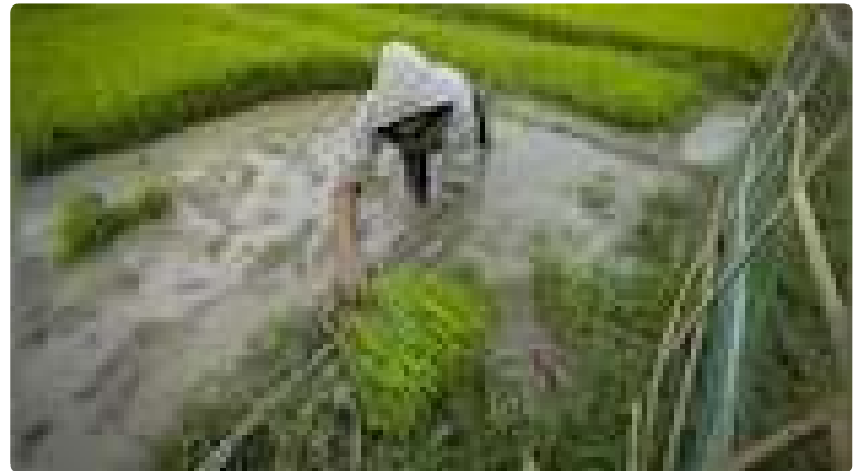
Vantage | How India can help in Asia's big rice crisis